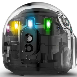
Figure 2: Ozobot Evo from Evollve.

The presented system is intended to study various abstract models of the MAPF problem from the perspective of plan execution on real robots Ozobots. The initial empirical evaluation [Barták et al. , 2018] showed that there is indeed a gap